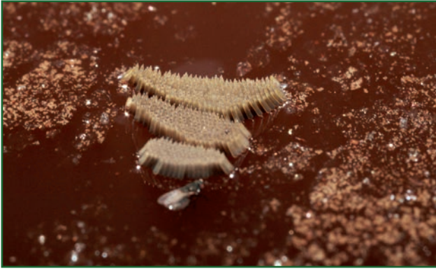
Figure 2. Mosquito eggs.

adult stage can fly and lives on land; the other stages are aquatic.