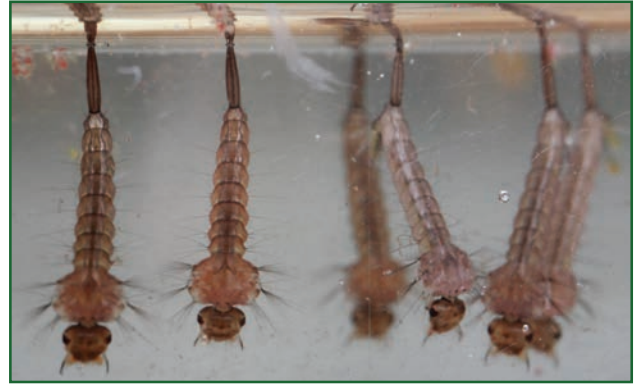
Figure 3. Mosquito larvae.

Wigglers live only in water and feed on microscopic plants, animals, and organic debris